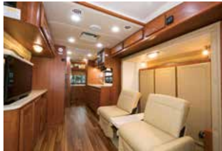
1 Lower the dinette table.

Setting it up is as easy as 1, 2, 3 . . .