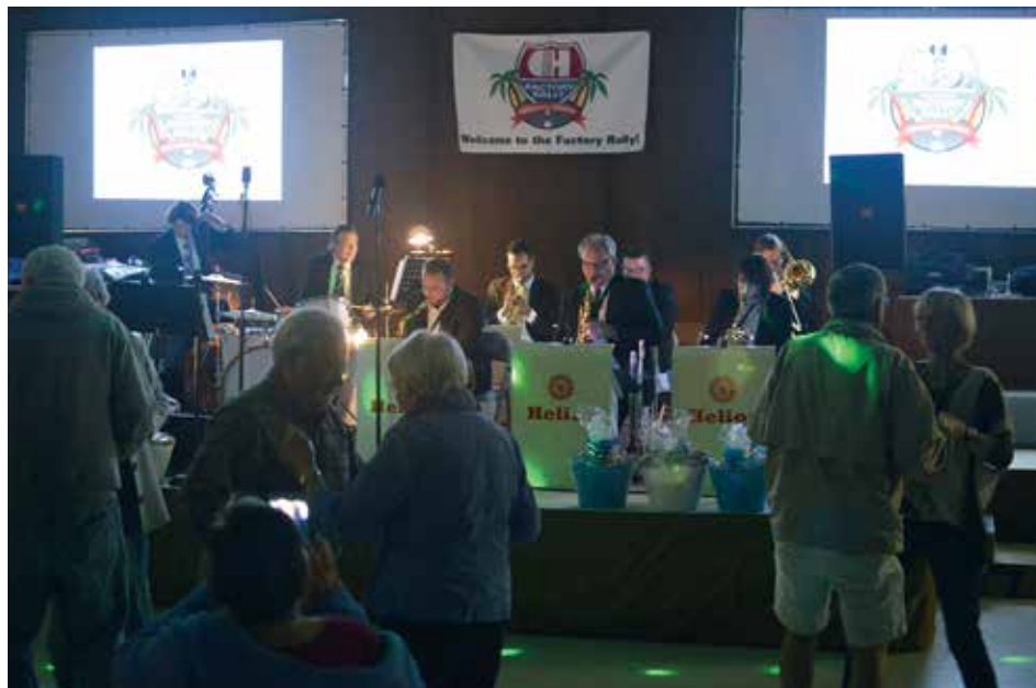
The Helios Jazz Orchestra had rally attendees cutting the rug Friday night.