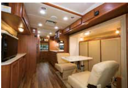
In the daytime setup, the swivel seats face the table.

Setting it up is as easy as 1, 2, 3 . . .