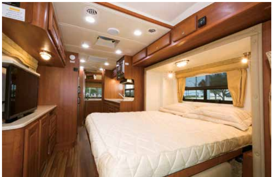
3 Press the button, and a hydraulic mechanism gently lowers the bed, with the covers in place! Note that even with a generously sized mattress, there is still plenty of room in the aisle to move around the motorhome.