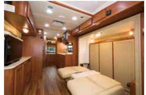
2 Fold down the dinette seats.