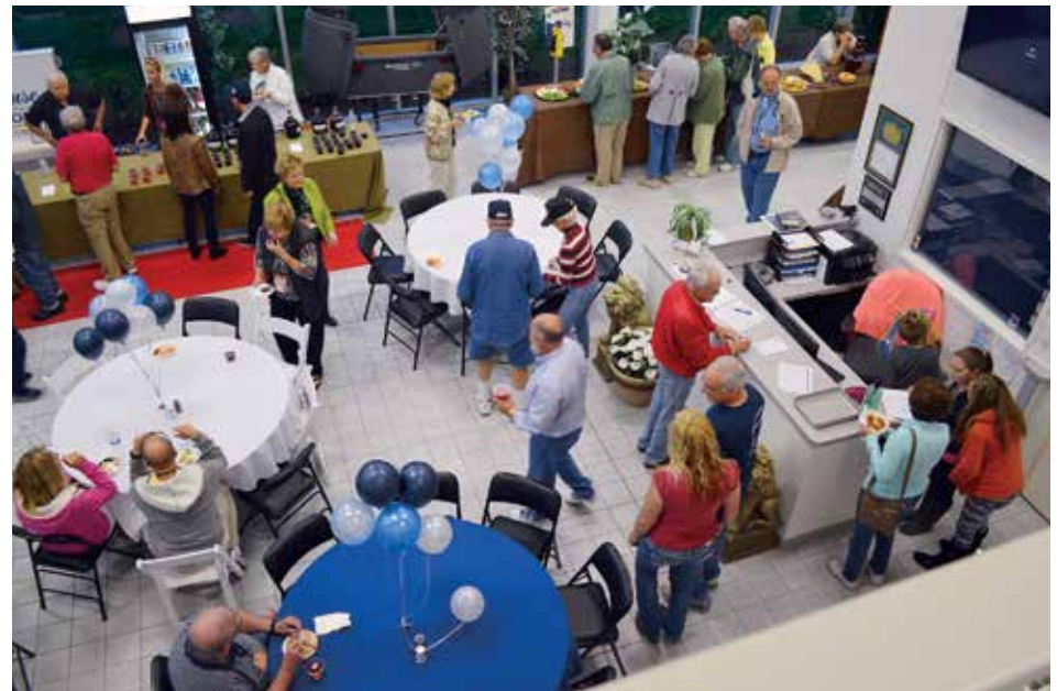
Attendees mingle at Friday’s opening reception in the Coach House showroom.