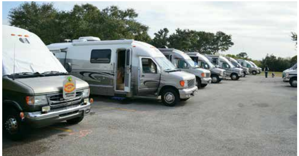
Coach House motorhomes are lined up in the factory parking lot.

After breakfast Sunday morning, the rally broke camp as the attendees bid farewell to their old and new friends in the Coach House family.