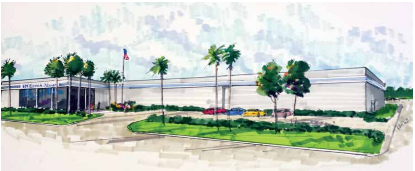
Artist's rendering depicts how the Coach House building will look once complete. The addition is at the right.