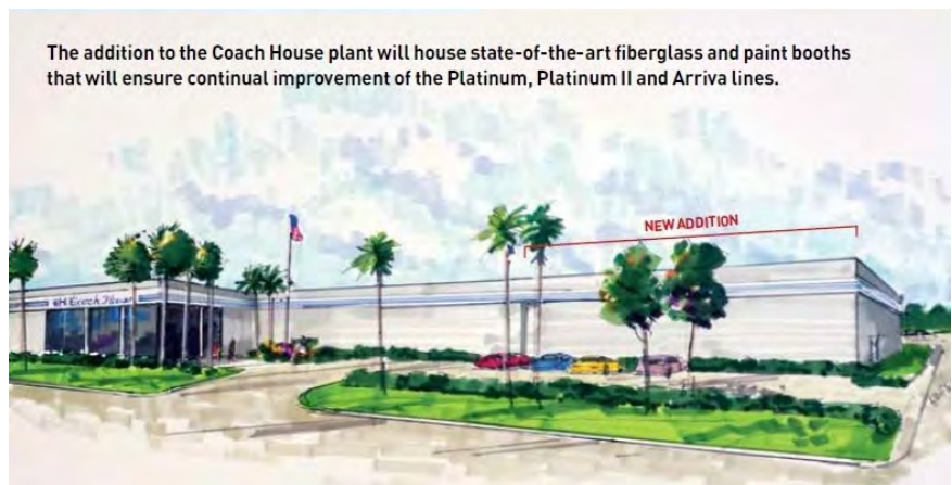
The addition to the Coach House plant will house state-of-the-art fiberglass and paint booths that will ensure continual improvement of the Platinum, Platinum II and Arriva lines.