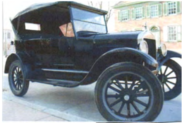
The Henry Ford® Dearborn, Michigan

On our first tour day we visit the Ford factory where we see an introductory movie followed by a tour showing the actual making of the Ford F-150. We visit the home and grounds of Eleanor and Edsel Ford and have lunch at their home.