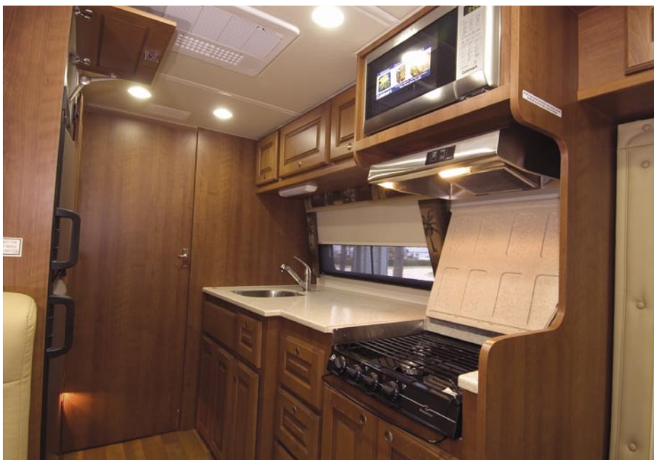
Cabinetmakers' skill is on display in this cherry wood Platinum galley.

The cabinet shop is also responsible for fabricating the Corian® countertops that are used throughout the Platinum. Again, the peculiar requirements of motorhome construction make this a more involved process than making a countertop for your kitchen at home. First of all, many of our bathroom and kitchen countertops feature hinged sections that drop out of the way when not in use. And our kitchen counters feature fitted sink covers that must fit precisely into the sink openings. And if you look closely, you will see Corian tops on the small cabinets fitted into the front corners of the vehicles. And again, those must be carefully cut to fit into the curved corners of the vehicles. This is not a job for beginners!