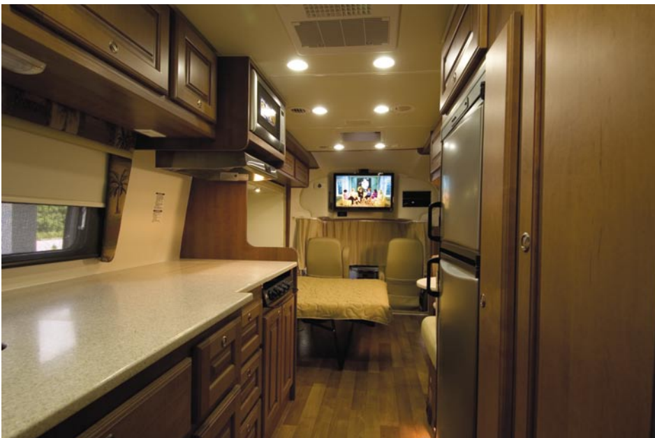
Looking forward from the bathroom in the new Platinum 261XL QD.

This year is my eleventh year at Coach House, and I want to thank all my customers and future customers for your phone conversations, thank-you cards, letters and support. I'll see you right here at Coach House the next time you stop in.