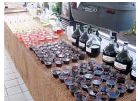
Wine glasses are neatly set up for Friday's opening reception.