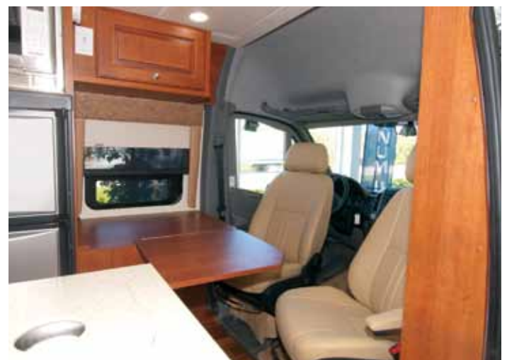
Front seats swivel to face fold-down table.