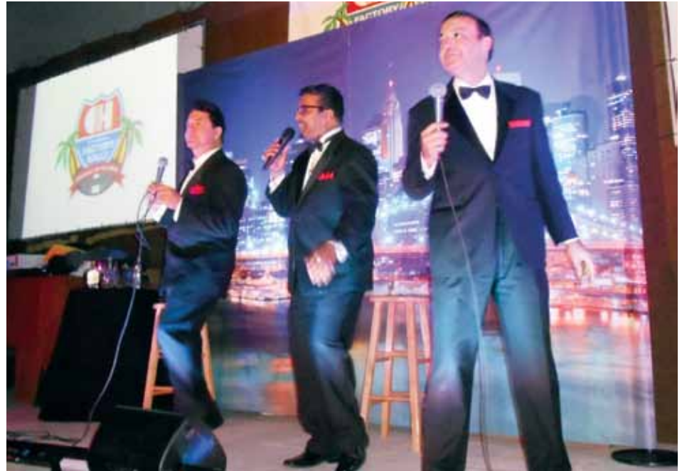
The Central Florida Rat Pack entertains the crowd on Saturday evening.

The Factory Rally is sponsored each January by Coach House. It provides an