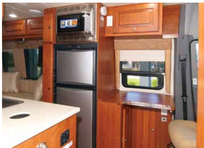
A view of the kitchen taken through the side door.