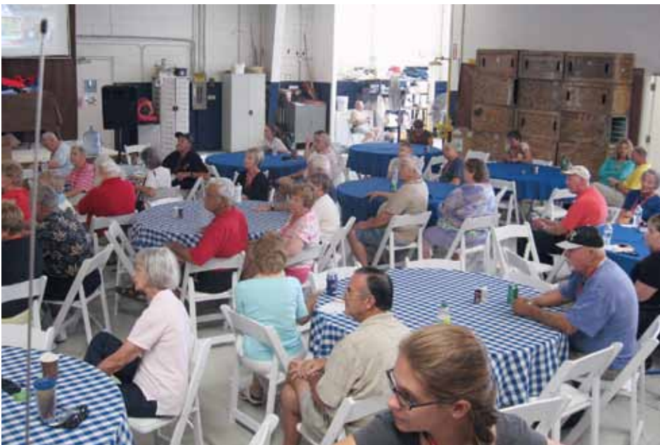
Rally attendees gather for informational session Saturday afternoon.